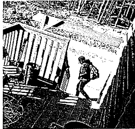
Video footage from Kimberly Neptune's neighbor's, Melissa Martin, outside camera dated 4/21/22 807AM